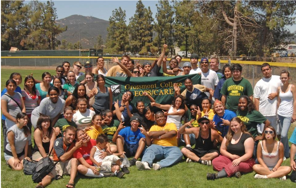
GROSSMONT COLLEGE EOPS (EXTENDED OPPORTUNITY PROGRAMS AND SERVICES)