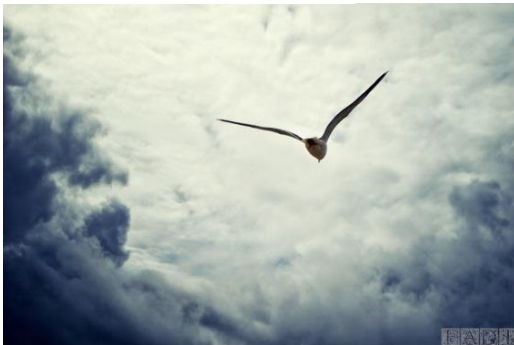
Picture 1 shows freedom and life without limits. It shows the beauty of the sky and how the bird is not afraid of flying to the unknown.