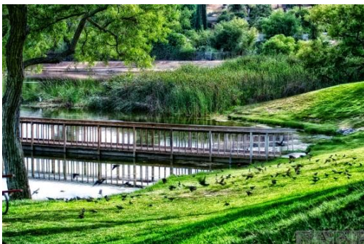
Picture 2 shows the beauty of nature and how all of its amazing components work together to make a perspective to enjoy looking at.

Poem written by Dhaha Nur. It is a composition of her thoughts regarding life from her point of view.